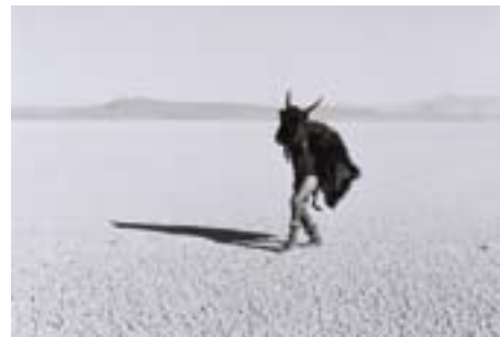
15 ~ SE Playing on the Playa 05-8 By Adrian Stimson, Banff Centre Alumnus 8" x 12" digital file to digital output, framed Value: $500 Courtesy of Adrian Stimson