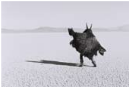
14 ~ SE Playing on the Playa 05-9 By Adrian Stimson, Banff Centre Alumnus 8" x 12" digital file to digital output, framed Value: $500