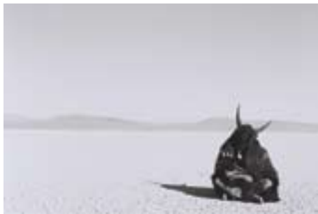
13 ~ SE Playing on the Playa 05-2 By Adrian Stimson, Banff Centre Alumnus 8" x 12" digital file to digital output, framed Value: $500 Courtesy of Adrian Stimson