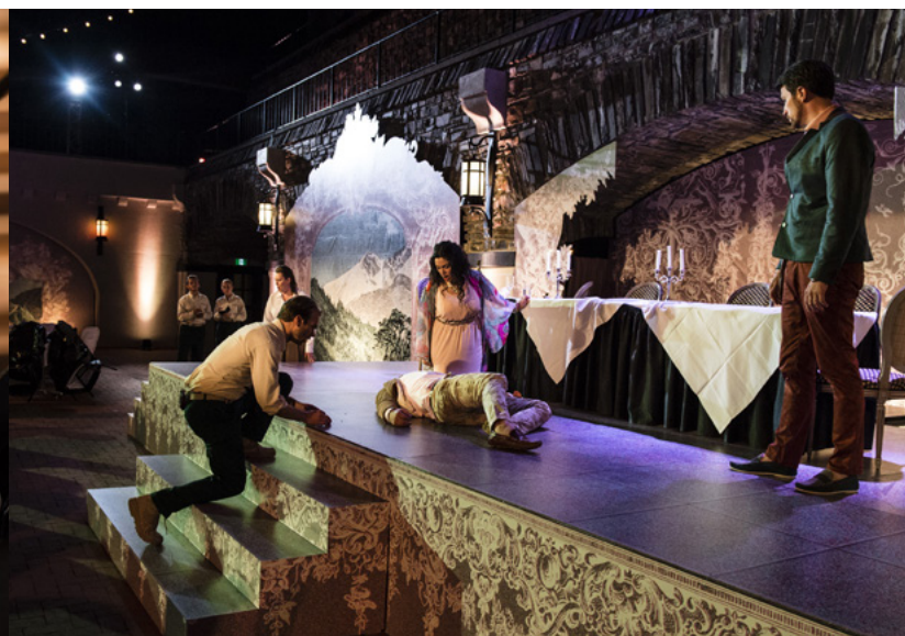
#UncleJohn, Opera, The Banff Centre 2014.