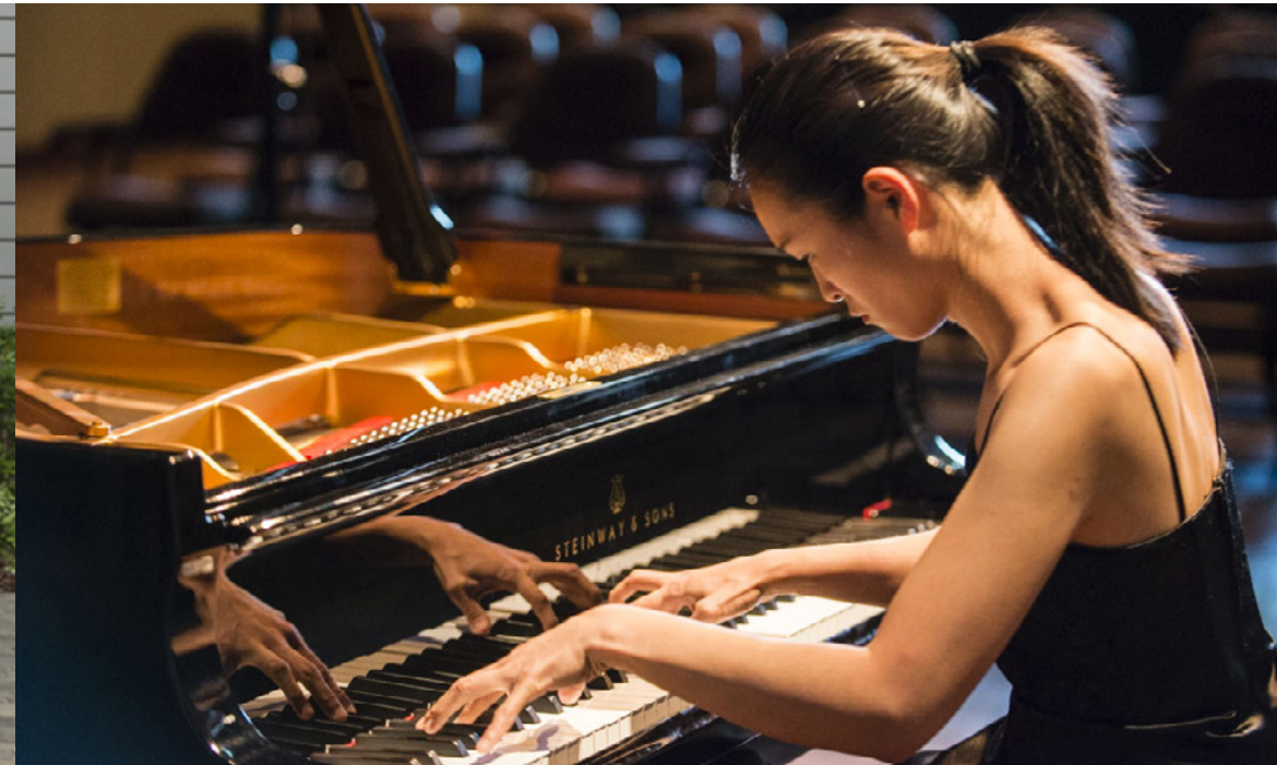
Roslton Recital Hall, Piano, Solos.