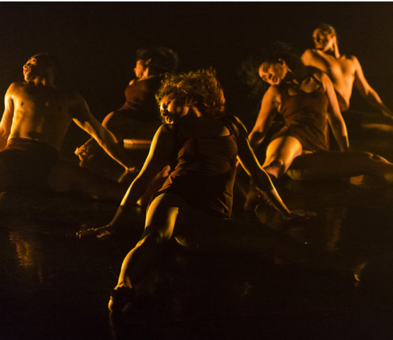
Trace, Indigenous Arts, 2014.