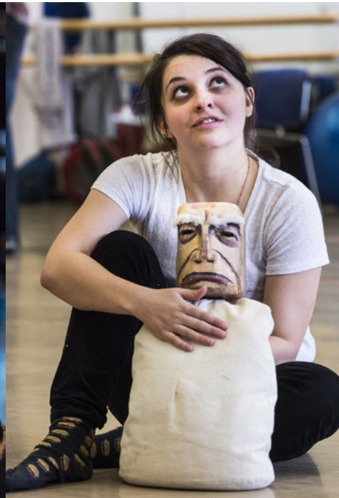
Puppet Workshop, The Banff Centre, 2014.