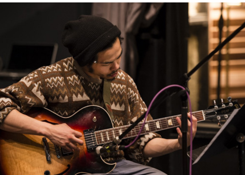
Jazz, The Banff Centre, 2014. Photo by Don Lee