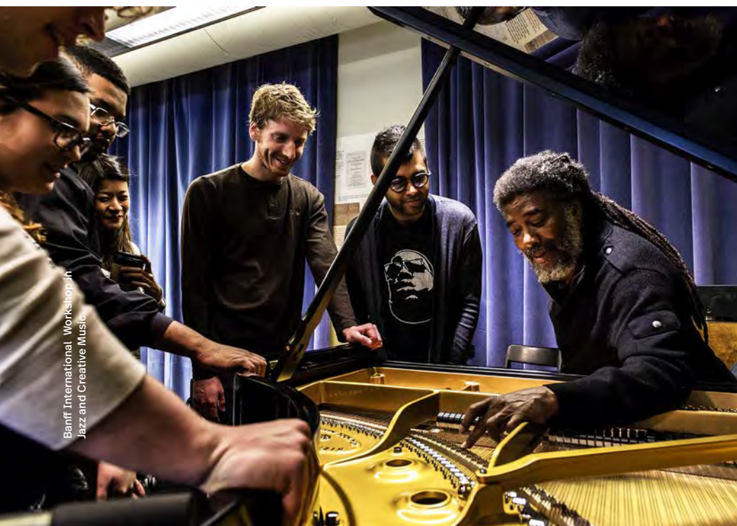
Banff International Workshop in Jazz and Creative Music

earn their living from artistic practice, and serve as mentors or teachers within their community