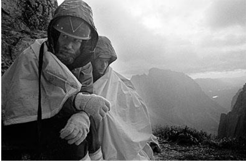
Untitled, Cirque of the Unclimbables, Northwest Territories, Canada Grand Prize, 2006 Banff Mountain Photography Competition