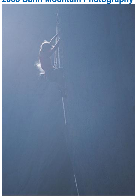
Rim Lit Climber, Céüse, France Grand Prize, 2008 Banff Mountain Photography Competition

2008 Banff Mountain Photography Competition