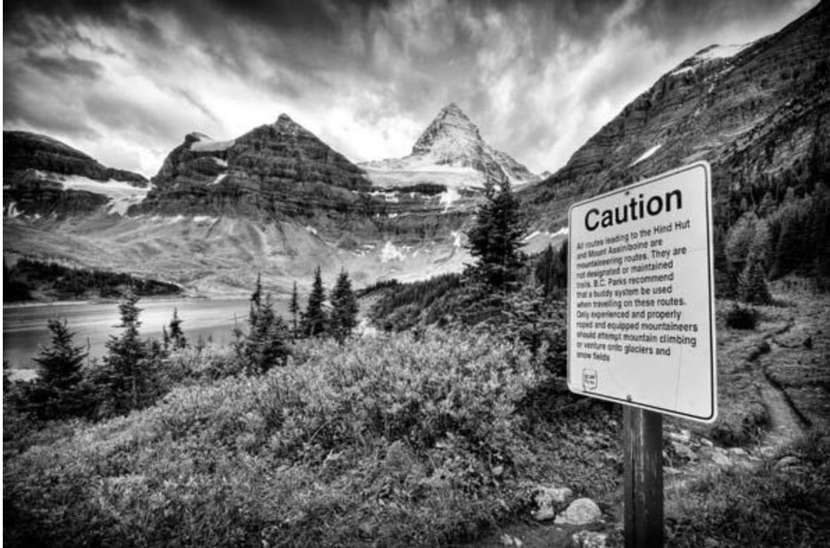
Hind Route, Mount Assiniboine Provincial Park, British Columbia, Canada

"Mount Assiniboine has had a grip on me since the first time I glimpsed the mist-cloaked summit emerging from behind Wedgewood Peak years ago. Words fail to describe the emotion that this mystical landscape summons within me, and I long to return over and over again. Its spectacular and raw beauty is rarely matched within the expanses of the Canadian Rockies. I am torn between the colour and monotone versions of the image, but I feel that the black and white commands attention through its tonal depth and contrast. This is my favourite personal photo of Assiniboine. "