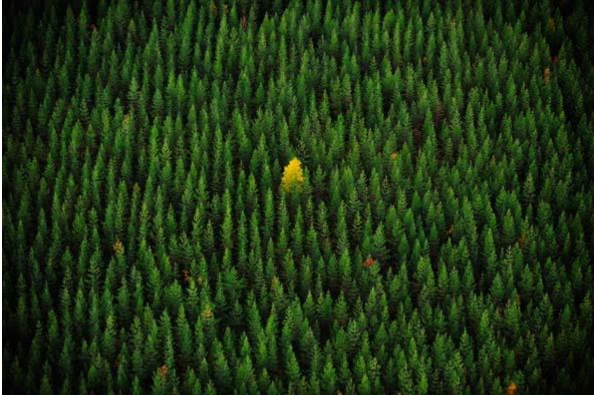
Alone, Surrounded by Spruces, Jämtland, Sweden

"It was fall and I was shooting aerial images for the municipality in Jämtland and we were heading for an island to shoot straight from above. We had just a few minutes of good light left and I turned my head and there it was . one yellow-coloured tree, shining all alone, surrounded by thousands of green spruces. I just had to shoot this. I got one shot... Finally, at home, this was the one image I was most interested in!"