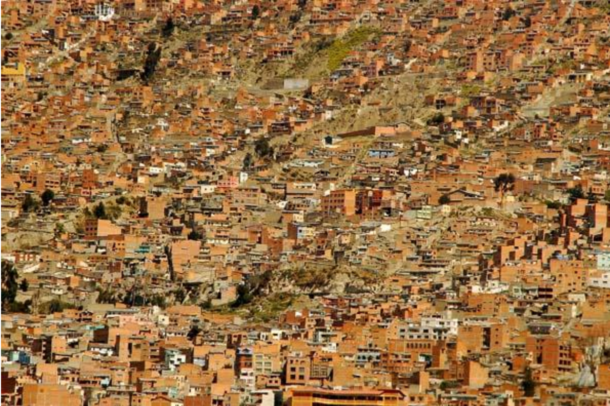
La Paz, Bolivia

"I spent several months living in La Paz, using it as my base for many adventures in the surrounding mountains. Returning to the capital of Bolivia from the solitude of the wilderness can be a shock to the senses and highlights how the mountain environment can be altered by humans. These buildings have been set on very steep slopes so the Pace os live in an almost vertical agglomeration. Their houses are built literally on top of each other . a most meaningful and unforgettable image of their lifestyle."