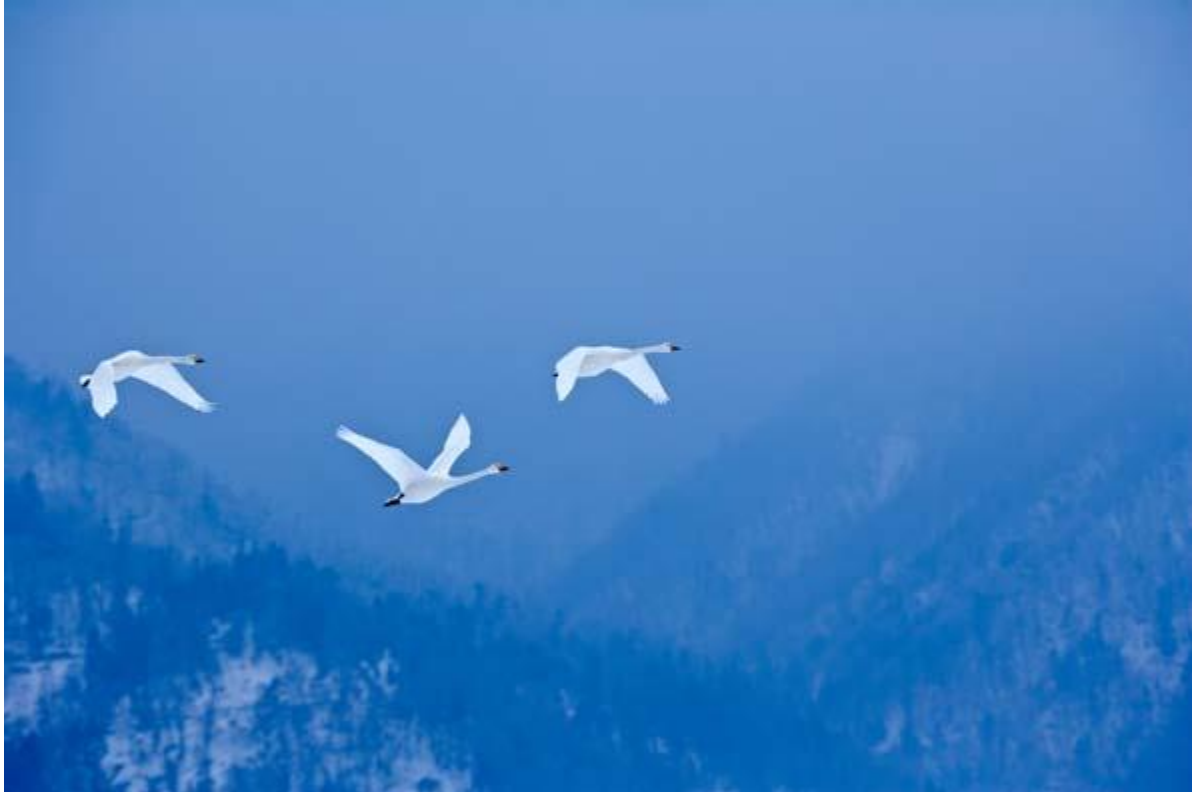
Winter Flight, Lake Kussharo, Japan

"I can't help but feel the cold in this picture, which is what first attracted me to Japan's northernmost island of Hokkaido in the middle of winter. This is nature at its best. The resilience of these whooper swans can best be admired when it's -20°C outside. Yet for the swans this is considerably more comfortable than the -60°C temperatures they leave behind in the Russian Far East during their winter migration. Whooper swans remain monogamous in all but a few examples. I like to think that maybe the cold helps keep them together, especially at night."