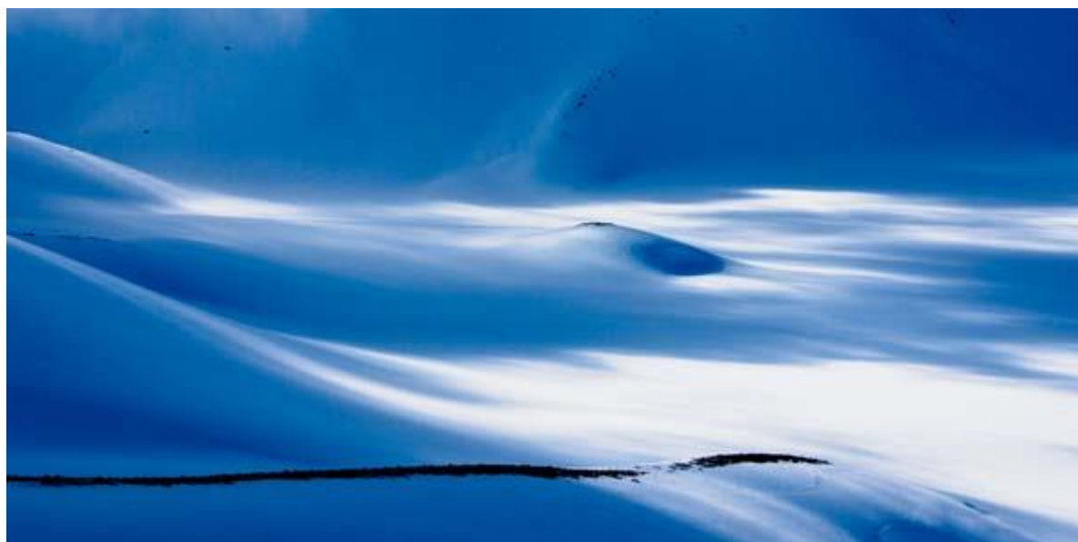
Alpine Light, Mount Tongariro, New Zealand

"I took this shot just before descending into the central crater of Mount Tongariro on the North Island of New Zealand. The volcano lay under about 2.5 metres of snow that covered the whole central crater, with the exception of some small patches of rocks that were being heated by the volcano's core. There was the most amazing light, which was constantly changing as the clouds danced across the sky, leaving behind their deep azure blue shadow on the sinuous landscape."