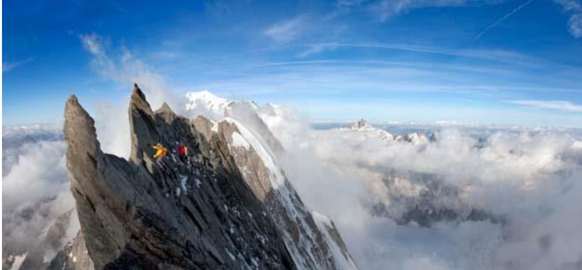
First Ray of Light, Pointe Young, Grandes Jorasses, France

"I compose my pictures on-the-spot while playing hide and seek with the atmosphere around me. For me, photography is fun, intuitive and joyful. I am forever on the lookout for movement, allusions, reflections, and thematic shocks in the subjects that fascinate me most: extreme sports, nature, and the environment. Permanent contact with nature is essential to me, whether it be via sport or simply observing it. I feel a need to live in wild places, close to the elements and to travel to the ends of the earth."