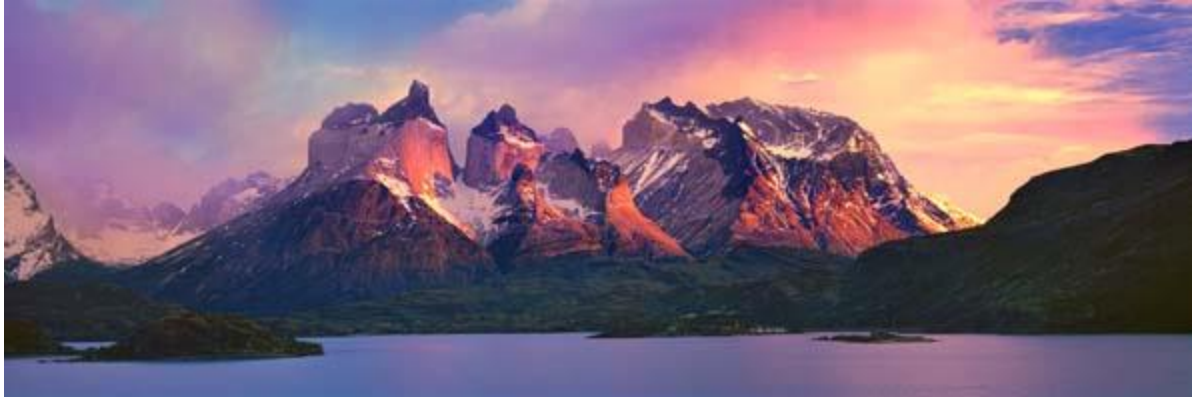
Sunrise on Cuernos del Paine over Lake Pehoe, Torres del Paine National Park, Patagonia

CHRIS MORRISON: SUNRISE ON CUERNOS DEL PAINE OVER LAKE PEHOE