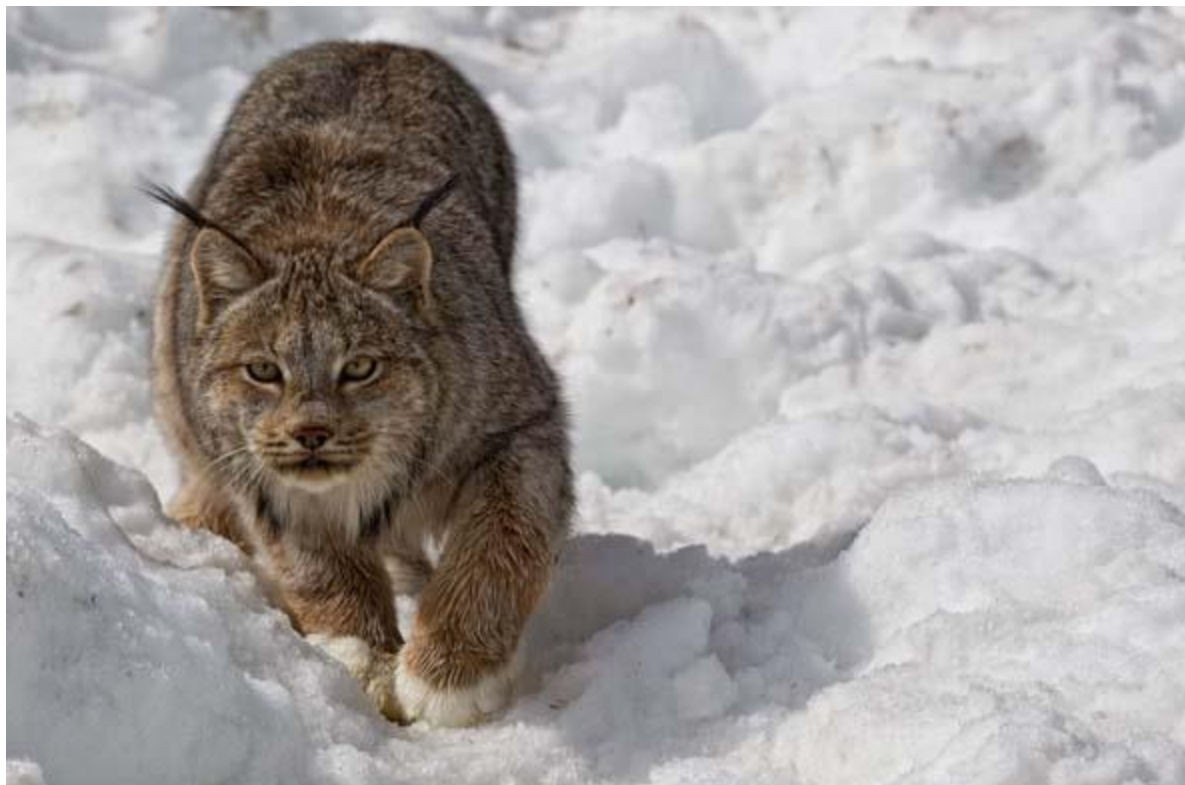
Lynx, Yukon, Canada

"Each spring in the Yukon, lynx appear along the roadways to hunt, mainly for rodents. They tend to stick around one spot for a couple weeks at a time and seem to have no concerns about who is watching them. Near Watson Lake, Yukon, this lynx came out of the bush and became aware of me as I shot from my truck window, using it as a blind. On this occasion, it stayed around for a little while before silently disappearing into the bush. I never saw it again."