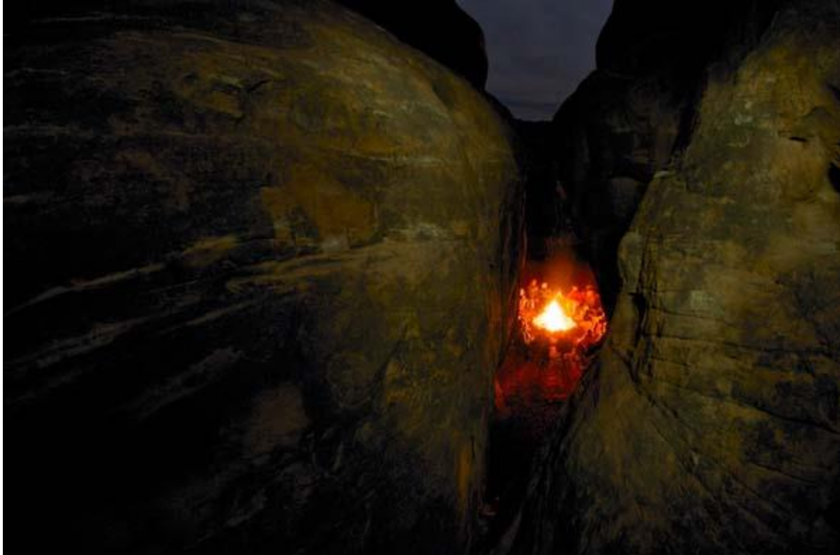
Desert Tribe, Indian Creek, Utah, USA

"Indian Creek, Utah is a mecca for rock climbing. This image was made on Thanksgiving Day of 2009 during a climbing pilgrimage to this beautiful area with fellow Boulderites. We had just wrapped up a great day of climbing and started enjoying a tasty Thanksgiving potluck feast by the campfire. The fire was lighting the slot canyon walls with an incredible glow. I made my way to the top of the rock formation and during a long exposure painted the rock walls with my headlamp to reveal a bit more detail and depth. I feel the result has a strong tribal feel to it which is consistent with the overall vibe of our trip."