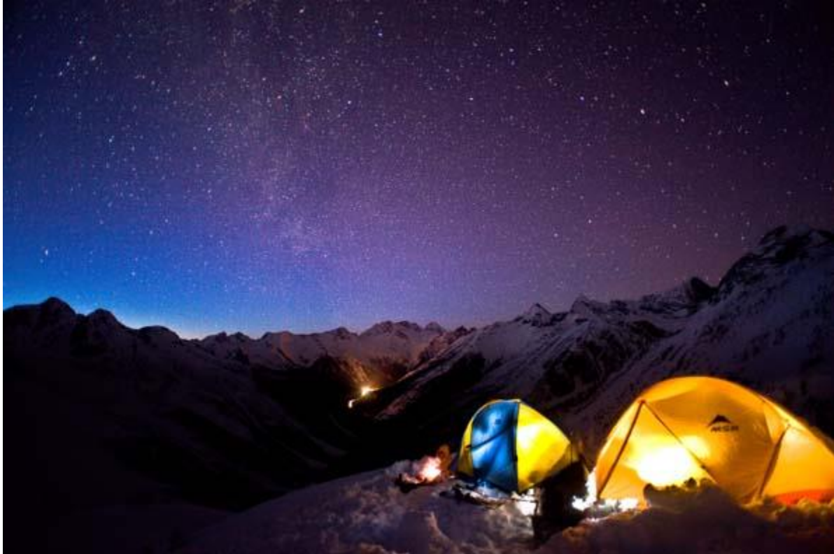
Asulkan Pass, Glacier National Park, British Columbia, Canada

"A late-winter ski touring trip to Asulkan Pass provided us with a perfect night and a reminder of the vastness of this universe and our infinitesimal place within all its celestial wonder. Yet watching the constant truck traffic snaking along Highway 1 throughout the night, our addiction to "growth" came into sharp relief. Can we honestly say that we are indeed aware? What has become of our humility and gratitude towards the Earth and all the living things that collectively share it? Where is our respect and reverence for the unfathomable joy, which is life, and this planet that sustains it?"