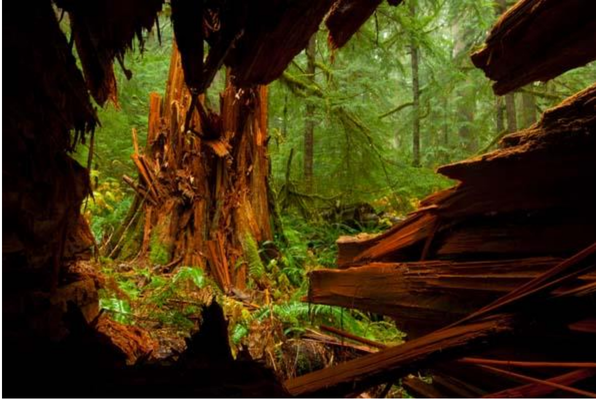
Forest from the Tree, Mount Rainier National Park, Washington, USA

"Using one element within a scene to frame another is a powerful compositional technique. On a hike in the Carbon River valley of Mount Rainier National Park, I stumbled across such an opportunity. Just off-trail, a large old-growth tree had succumbed to a storm's fury and sheared just above its base. The fallen tree was large enough to crawl into and once inside, I worked through different compositions including the one you see here. The jagged edges of the opening seem to point back to its former base."