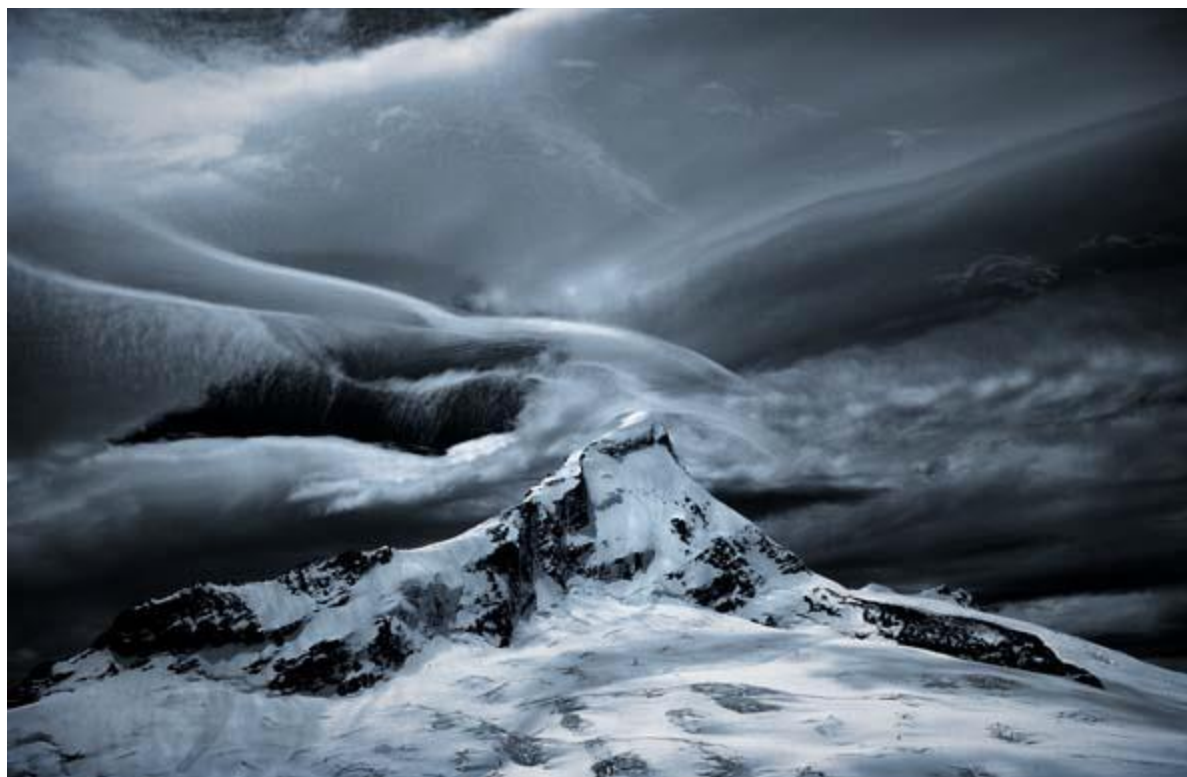
Storm Clouds over Mount Aspiring, Aspiring National Park, New Zealand

IAIN GUILLIARD: STORM CLOUDS OVER MOUNT ASPIRING