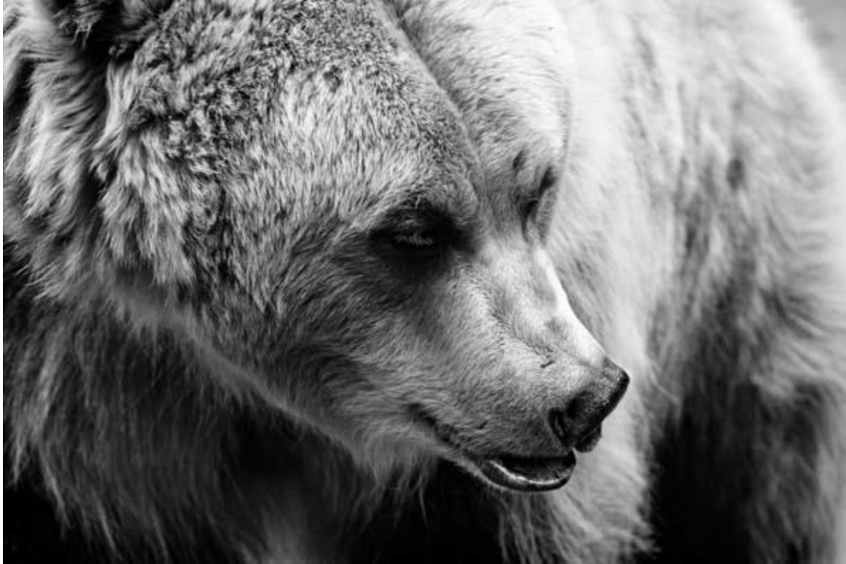
The Happy Hunter, Yellowstone National Park, Wyoming, USA

"Celebrated in late-September each year, National Public Lands Day is the perfect time to revel in the raw beauty of our country's wild lands. Roads and trails are free of bustling summer crowds and wildlife is actively preparing for winter's big sleep. In 2008, I was fortunate enough to encounter this magnificent bear foraging in Yellowstone's Hayden Valley. Powerful, majestic, and just a little bashful, he made it perfectly clear that nature's delicate balance still exists as it should in America's first national park."