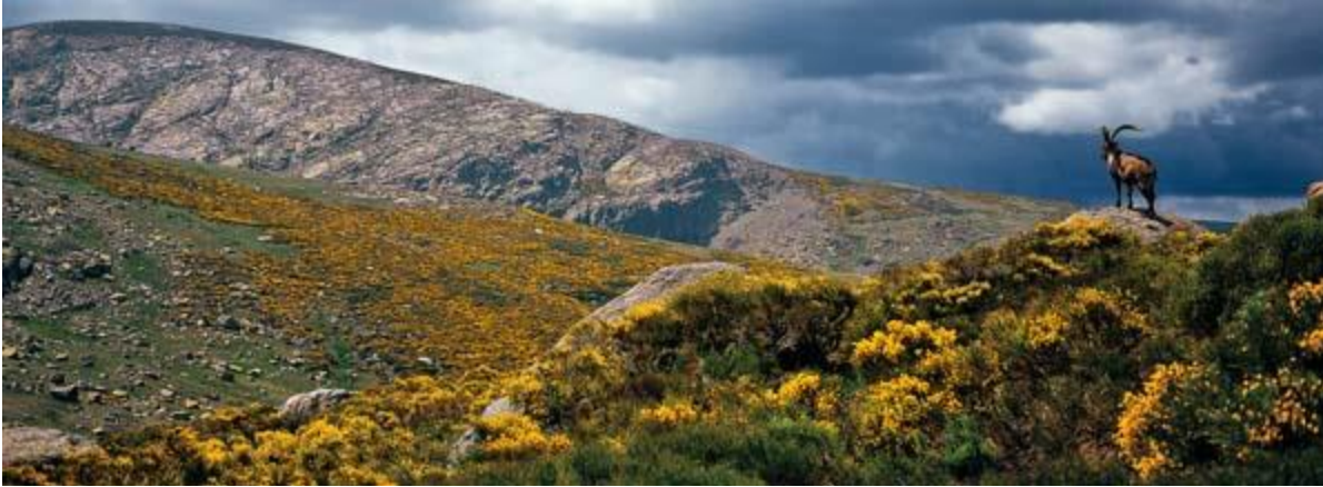
El Vigía (The Watcher), Sierra de Gredos, Spain