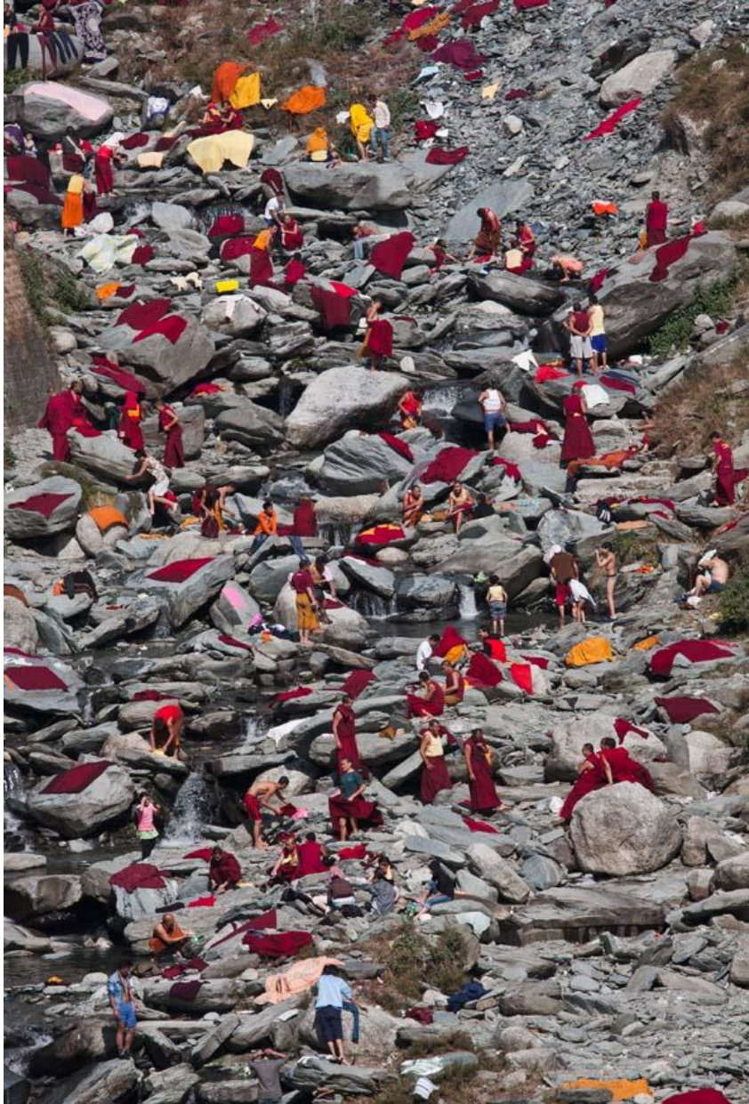
MonksqRiver, Dharamsala, India

"While attending the annual teachings of His Holiness the 14th Dalai Lama, I explored the surroundings of McLeod Ganj, a small village of the Himachal Pradesh District, India, and discovered the stunning scenario of the Bhagsu Waterfall trail. A few monks were washing their robes or shaving their heads or just relaxing. I took some photos. The next day, I invited one of my Buddhist colleagues to join me in a second visit there. When we arrived at the beginning of the trail I photographed what I saw . a dreamlike image . A Monkq River."