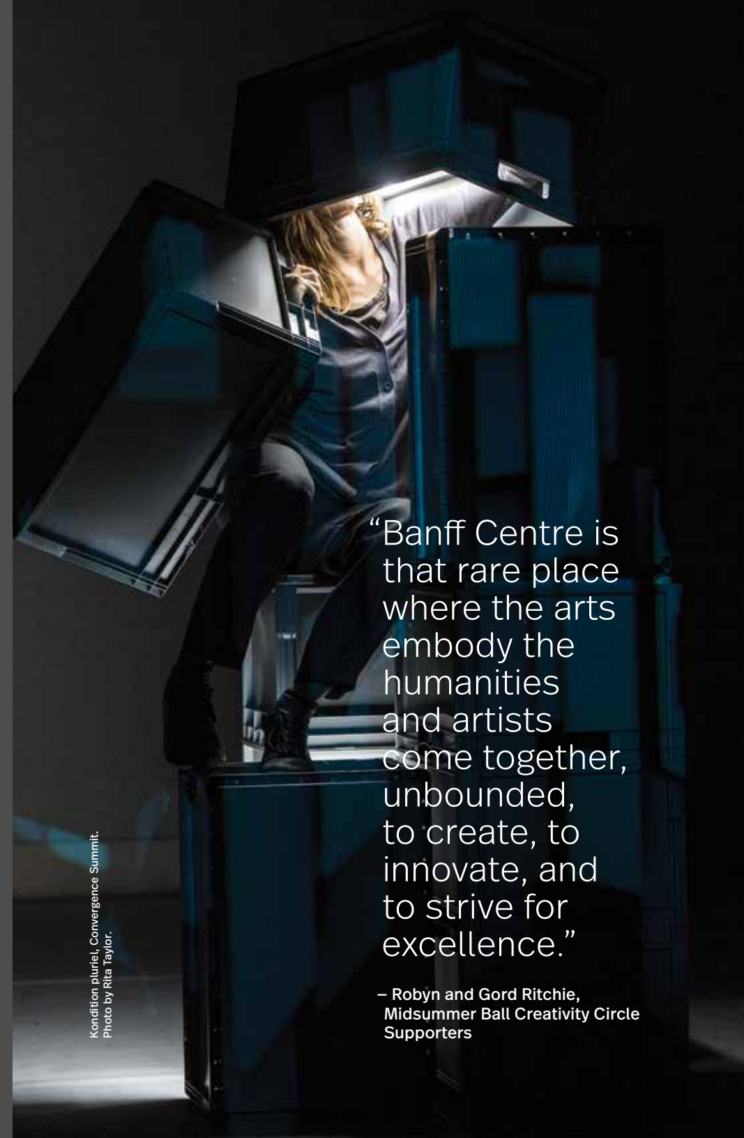
Kondition pluriel, Convergence Summit.