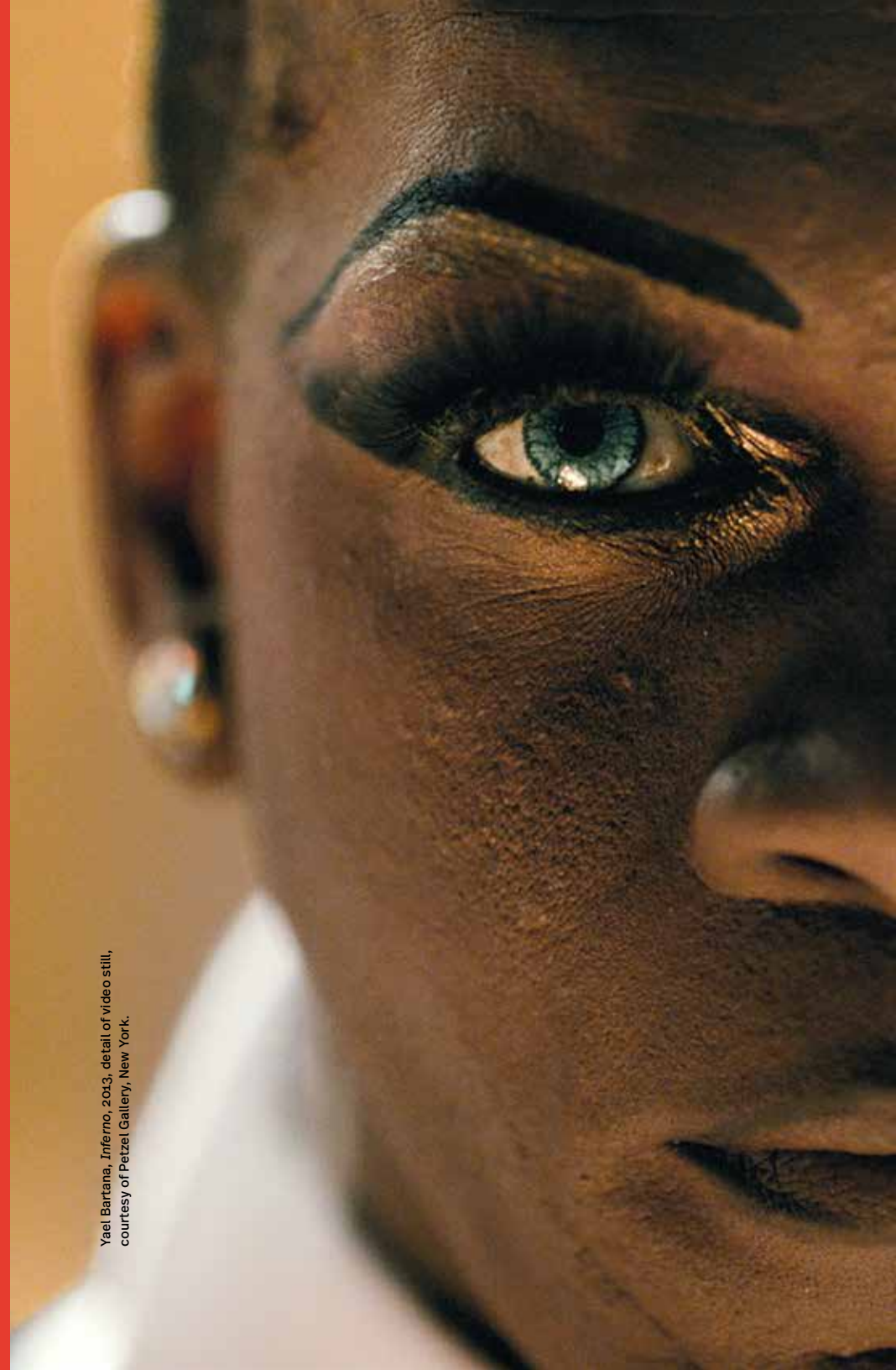
Yael Bartana, Inferno, 2013, detail of video still

Our programs focus on professional development, research, and training opportunities in media and visual arts. The programs provide access to world-class facilities in photography, sculpture, printmaking, papermaking, ceramics, textiles, painting, performance, media arts, film and video, as well as curatorial and critical studies. Residencies are for professional artists with an exhibition record who have had formal training in visual arts, or equivalent experience and recognition from their peers.